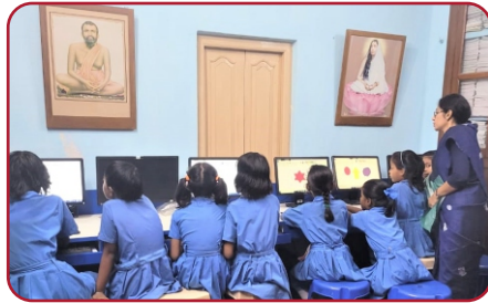
Computer teaching at Gadadhar Sishu Vikas Kendra