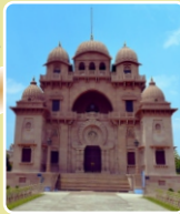
Belur Math, Howrah (Headquarters of Ramakrishna Math and Ramakrishna Mission)