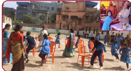
Annual Sports - Gadadhar Sishu Vikas Kendra