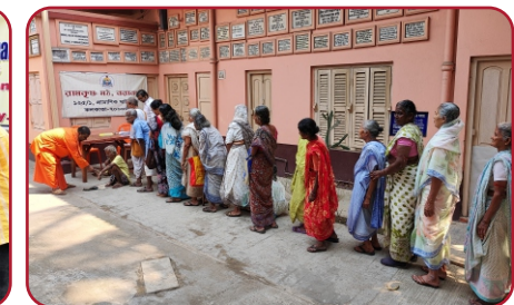
Pecuniary help to Elderly Infirms