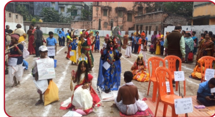
Annual Sports - Gadadhar Sishu Vikas Kendra