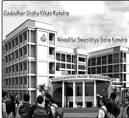
INDICATIVE DESIGN OF THE PROPOSED BUILDING OF GADADHAR SISHU VIKAS KENDRA AND NIVEDITA SWASTHYA SEVA KENDRA

Baranagar Math was started a new in the year 2004 as a Branch centre of Ramakrishna Math & Ramakrishna Mission, Belur Math, long after Swami Vivekananda and other Disciples of Sri Ramakrishna left this holy site in the year 1892. It was then observed that more than 100 slum pockets lying around this centre. The drive for education to the slum children, the first-generation learners, as well as free medical treatments for all was taken up as the first priority of social service to the people. The primary school was opened to impart education to the children, both boys and girls. Primarily there were about 10 students, the parents of whom were