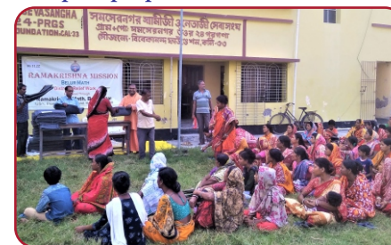
Distribution of Garments among poor villagers in 24-Pargis (N) district, W.B.