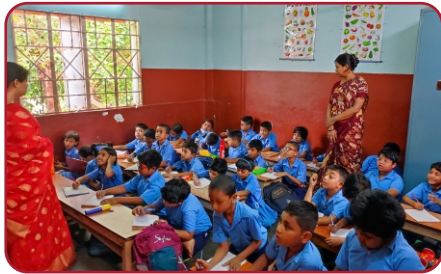
Classroom - Gadadhar Sishu Vikas Kendra