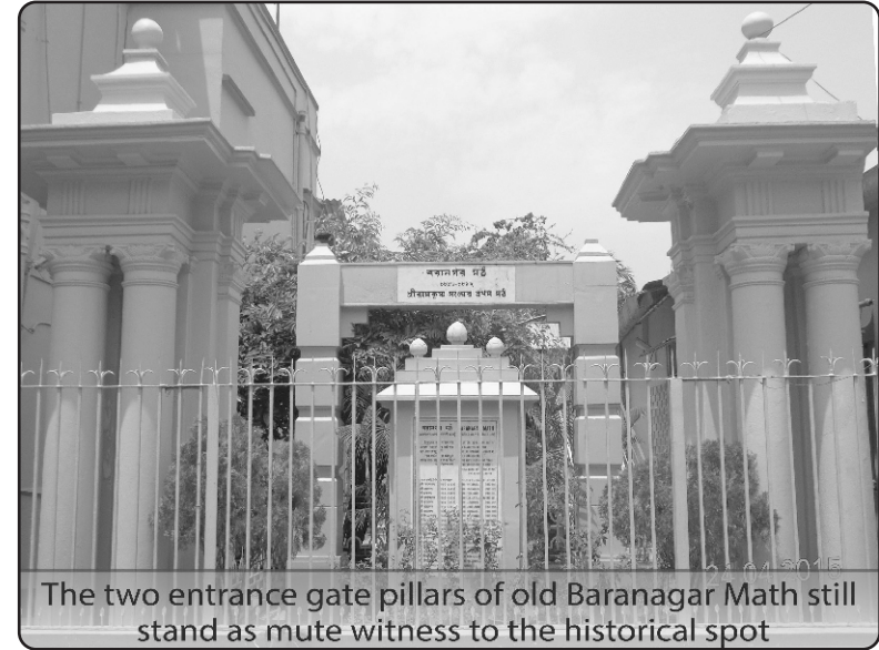
The two entrance gate pillars of old Baranagar Math still stand as mute witness to the historical spot