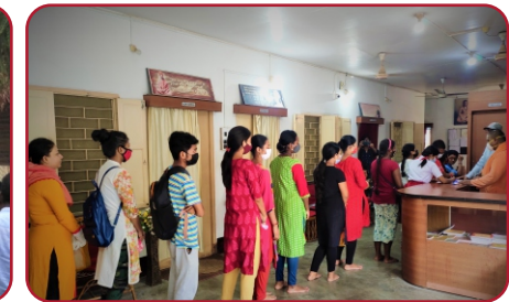
Scholarship to Poor Students