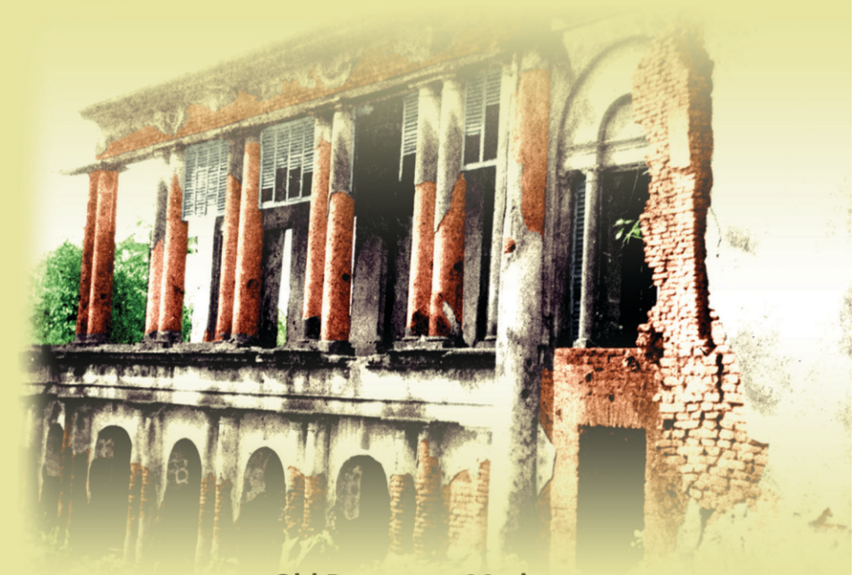
- Old Baranagar Math - (1886 - 1892)