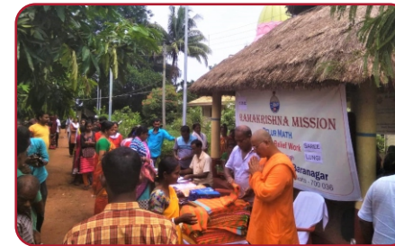
Distribution of Pre-Puja Garments among the poor people of Bankura district, W.B.