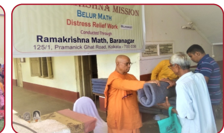
Distribution of blankets among poor villagers in Bankura district, W.B.