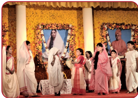
Cultural Programme by the students of Gadadhar Sishu Vikas Kendra