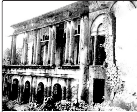
Baranagar Math (1886 - 1892) The First Monastery of Ramakrishna Order

After Mahasamadhi of Sri Ramakrishna, Narendranath (later Swami Vivekananda) founded Ramakrishna Sangha at a dilapidated haunted garden house at Baranagar in the later part of the year 1886. The first