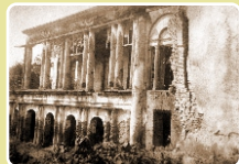
Old Baranagar Math, Kolkata The First Monastery, the Origin and Genesis of Ramakrishna Math and Ramakrishna Mission (October 1886 - February 1892)