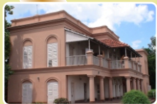
Nilambar Babu's Garden House, Howrah

The third Monastery was housed in this building on the bank of river Ganga (February - December 1898)