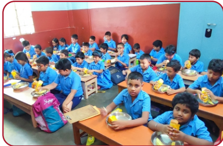
Daily refreshment to the Students of Gadadhar Sishu Vikas Kendra