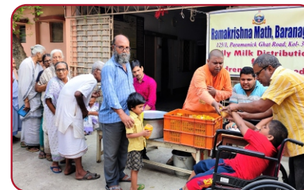
Daily distribution of Milk and Bread to poor children and needy people