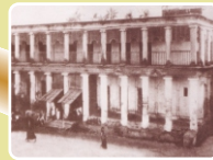
Alambazar Monastery, Kolkata The second Monastery near Dakshineswar Temple (February 1892 - February 1898)