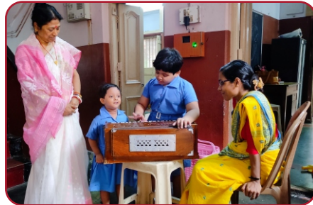
Music Class - Gadadhar Sishu Vikas Kendra